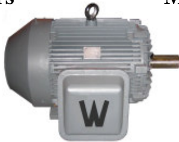
Explosion Proof Motors