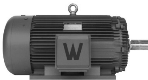
Rock Crusher Motors