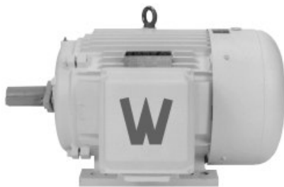
Oil Well Pump Motors