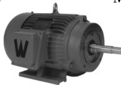
Close Coupled Pump Motors