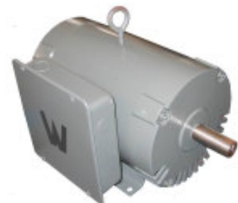
Single-Phase T-Frame Motors

“The Leader In Providing High Quality, Low Cost, Sourced Motors”